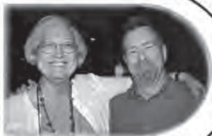
Connie Willis, James Patrick Kelly

Special room rates, $131.00 per night, are available for the weekend at the Best Western Executive Inn right across the street from the Experience Music Project/SF Museum, at 925 Westlake Ave., Seattle WA 98109. There are a limited number of rooms at this price; for hotel reservations, call (206) 674-6616 and mention the "Science Fiction Awards Group".